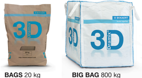
BAGS 20 kg